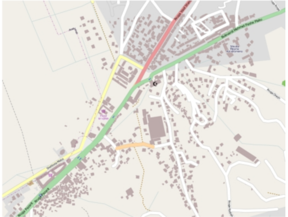
Figure 3: digitizing structures and points of interests in downtown Shkodra